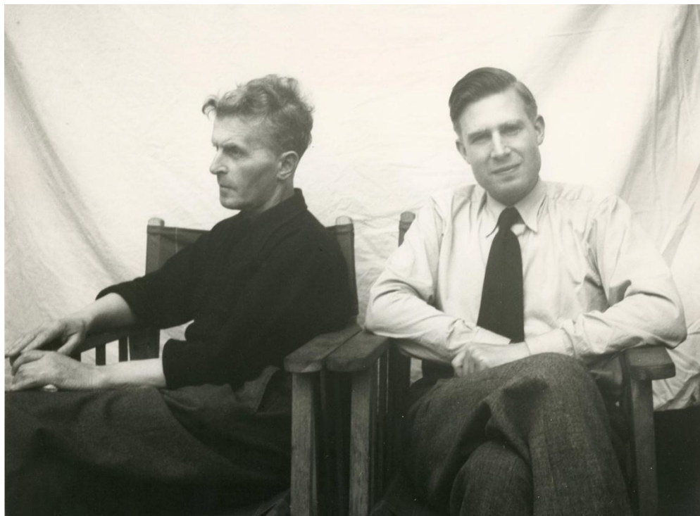
Fig. 3: Wittgenstein and von Wright in Cambridge.