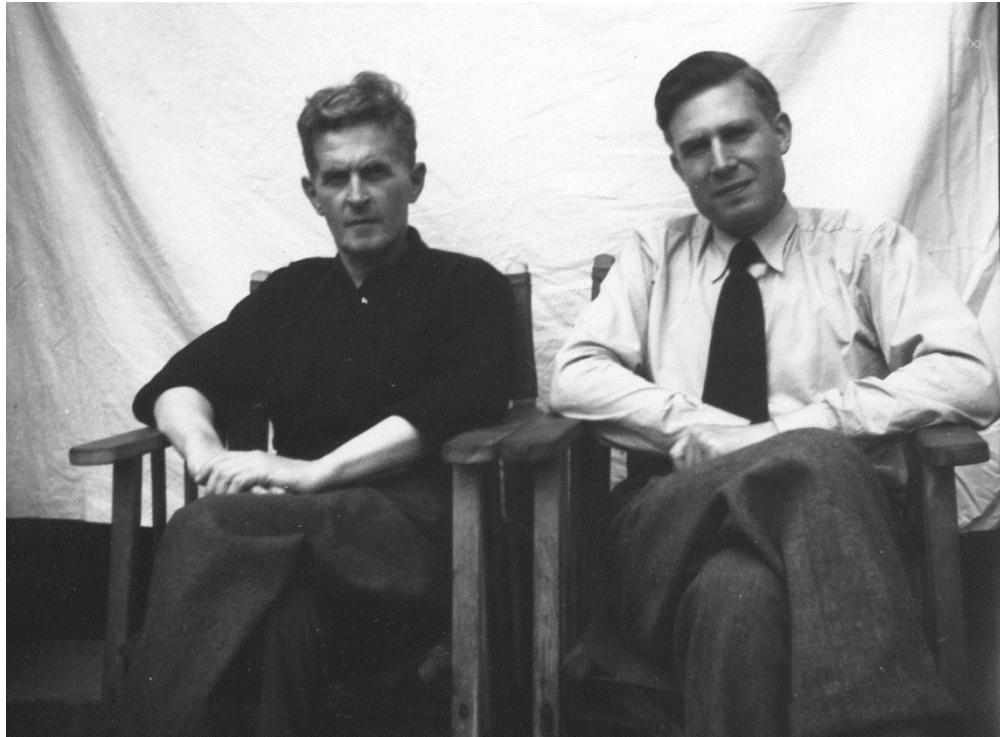
Fig. 2: Wittgenstein and von Wright in Cambridge.