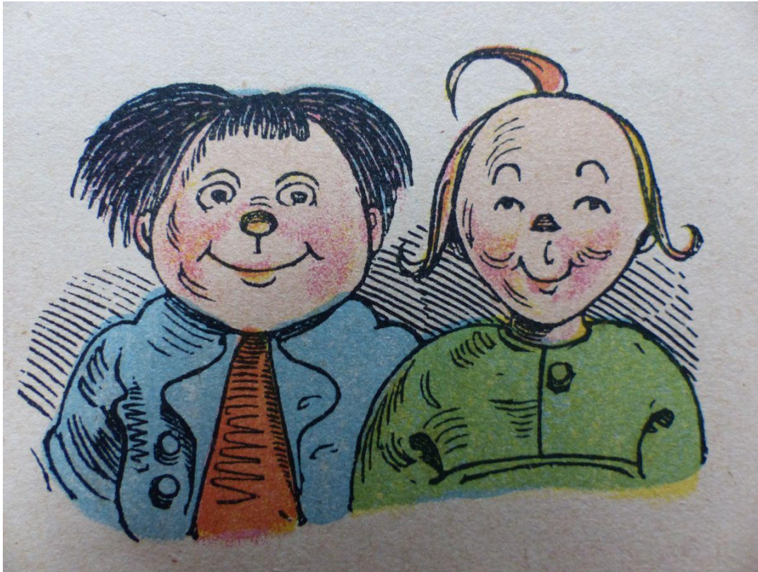
Fig. 4: Max and Moritz. Photo of a drawing on the first page of a copy of Wilhelm Busch's book Max und Moritz. Eine Bubengeschichte in Sieben Streichen. The book originally belonged to von Wright's home library.